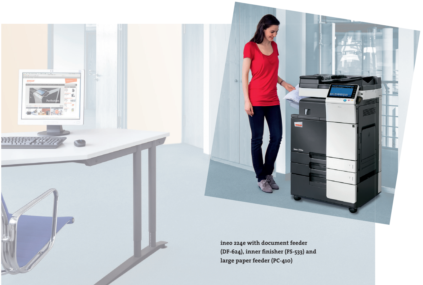
ineo 224e with document feeder (DF-624), inner finisher (FS-533) and large paper feeder (PC-410)

These black-and-white systems come with a number of energy-saving features that cut power consumption by over 40% compared to predecessor models. While this kind of economy saves money, other green features are ecologically beneficial. And that means DEVELOP's ineo e line-up is not only good for the environment but also boosts the owner's green credentials.